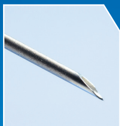
Introducer Needle with Echogenic Tip