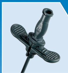
Peelable Sheath Introducer